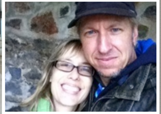
ENJOYING A FUN FAMILY DAY IN BRIGHTON!