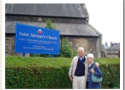
DAD & MOM